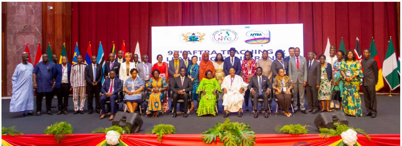
Ministers of Education and Dignitaries' photo session @ Ghana 2022